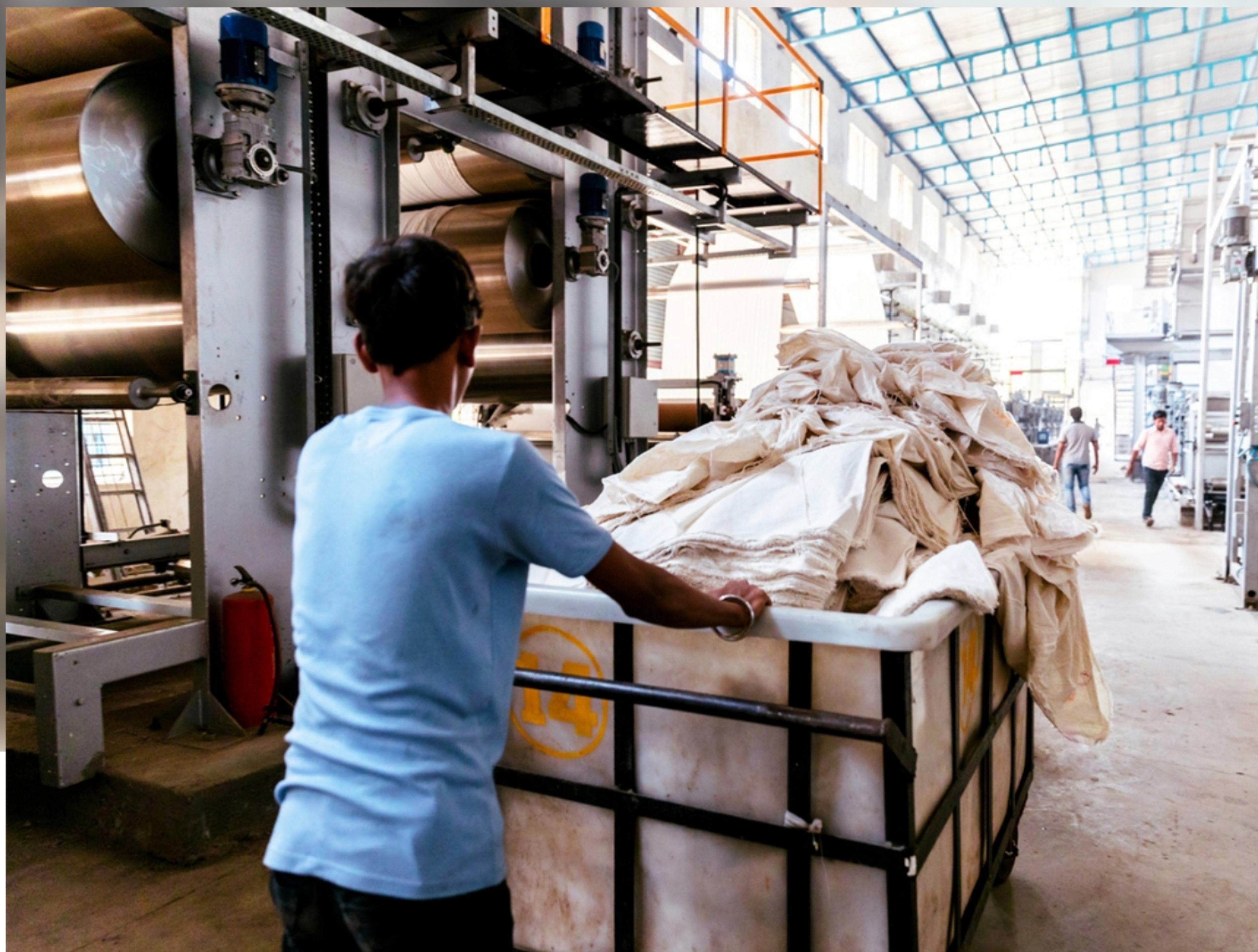
India has already sanctioned 59 textile parks under the Scheme for Integrated Textile Parks (SITP), of which 22 have been completed.